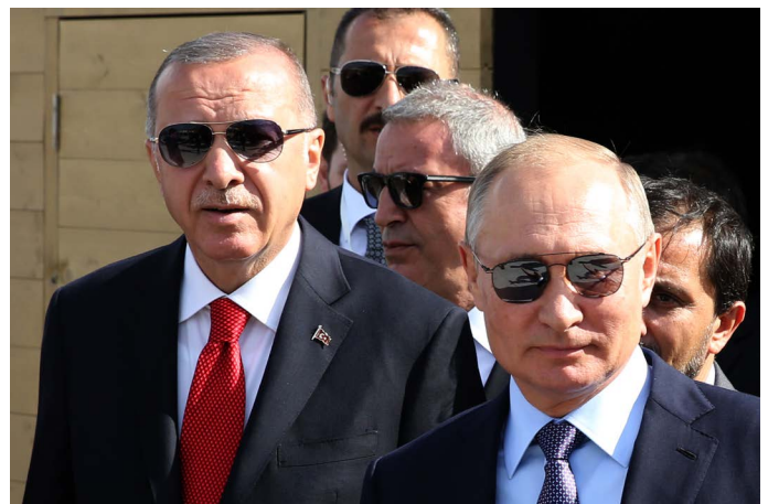
Putin and Turkish President Recep Tayyip Erdoğan in Moscow, August 27, 2019.

But there is more. Russia and Turkey have followed similar domestic political trajectories. In the 1990s and early 2000s, both countries implemented major domestic reforms, each pursuing its own path toward closer relations with Europe. In Turkey’s case, this approach included attempted membership in the EU. However, following a period of ultimately unsuccessful attempts at rapprochement with Europe, both countries experienced major shifts in their domestic politics with the emergence of strong and increasingly authoritarian leaders. As a result, their relations with the EU suffered, in large measure due to Europe’s dim view and