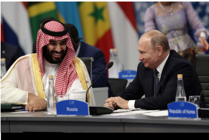
Saudi Crown Prince Mohammed bin Salman and Putin at the G20 Summit, November 30, 2018 (Photo by Alejandro Pagnii/AFP/Getty Images).

The Saudi king's visit was a milestone in another area critically important for both countries: coordination of their activities in the world oil market. 89 Because previous attempts by the two oil giants to coordinate their activities had failed, the agreement initially reached in 2016 was first met with skepticism. 90 The agreement was reaffirmed during King Salman's visit to Moscow and, despite repeated doubts about its prospects, subsequently extended on several occasions with plans under way to establish a long-term OPEC+ alliance notwithstanding the fact that Russia has not reduced its oil output except for a brief period in 2019—a cut that was due to temporary technical problems. 91 Despite that, the appearance of cooperation between Saudi Arabia and Russia in the oil market prompted criticism from Iran, whose OPEC representative complained in 2018 that the two were holding the oil market hostage and taking advantage of Iran when it was being pressured by the United States. 92