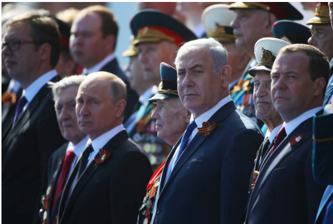
Russia's President Vladimir Putin and Israel's Prime Minister Benjamin Netanyahu observing the Victory Day military parade at Red Square, May 9, 2018.

There is indeed more to Russian-Israeli relations, which have steadily improved on Putin's watch. Israeli prime ministers have visited Russia on numerous occasions, and Putin has visited Israel twice, in 2005 and 2012. Russian-Israeli trade grew by 25 percent in 2017, even if it is still a relatively small total amount at about $2 billion. Israel has been negotiating a free trade agreement with Russia and with the Eurasian Economic Union, an economic bloc widely derided in the West as a tool of Russian neoimperialism. Israel and Russia have had visa-free travel since 2008. When the United States, the United Kingdom, and many other Western countries expelled dozens of Russian diplomats in March 2019 in retaliation for the nerve agent attack on a former Russian spy in Salisbury, England, Israel did not expel any.