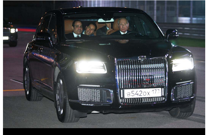
Putin and Egypt's President Abdel Fattah el-Sisi in Sochi, October 17, 2018.

Russian-Egyptian relations underwent a major improvement after Morsi was overthrown in a 2013 coup and Abdel Fattah el-Sisi became the new leader of Egypt. The two kindred spirits—former intelligence officer Putin returned to the presidency after large-scale protests and a flawed election, and former military intelligence chief Sisi rose to the leadership of his country following a military coup—evidently saw the vast potential benefit of improving bilateral ties between Russia and Egypt.