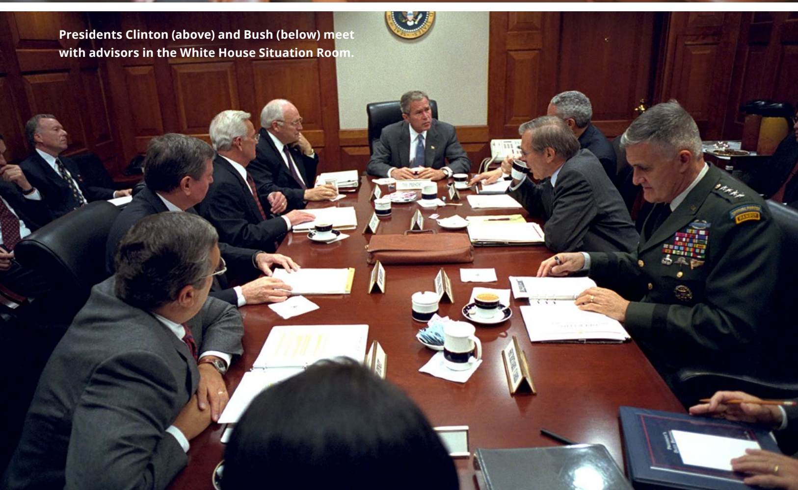
4 • U.S. LEADERSHIP AND THE CHALLENGE OF STATE FRAGILITY