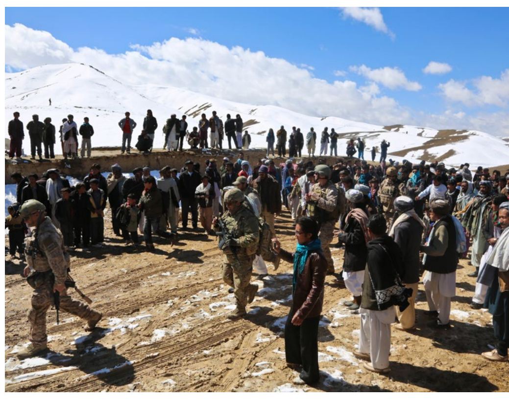
U.S. Special Operations Task Force provides security for local shura, Uruzgan province, Afghanistan, March 16, 2013.