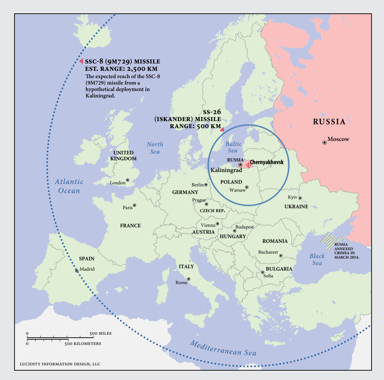
MAP 1 Range of Select and Prospective Russian Missiles

Sources: "SS-26 (Iskander)," Missile Threat, Center for Strategic and International Studies, September 27, 2016, last modified May 13, 2019, https://missilethreat.csis.org/missile/ss-26/; "SSC-8 (Novator 9M729)," Missile Threat, Center for Strategic and International Studies, October 23, 2018, last modified January 23, 2019, https://missilethreat.csis.org/missile/ssc-8-novator-9m729/.