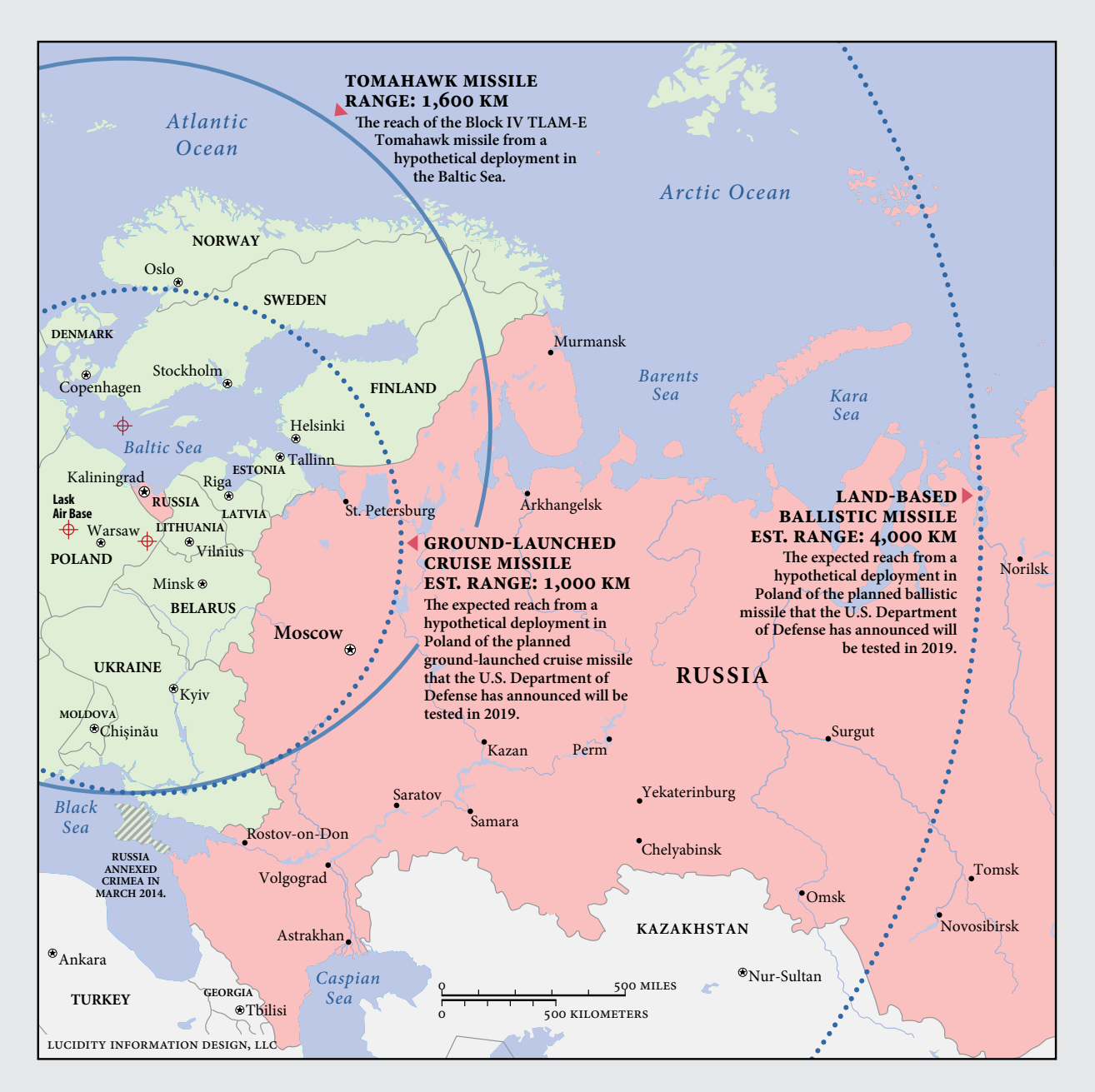
MAP 2 Range of Select and Prospective U.S. Missiles

Sources: "Tomahawk Cruise Missile," United States Navy Fact File, April 26, 2018, https://www.navy.mil/navydata/fact_print.asp ?cid=2200&tid=1300&ct=2&page=1; Michael Gordon, "After Treaty's Demise, Pentagon Will Develop Two New Midrange Weapons," Wall Street Journal , March 13, 2019, https://www.wsj.com/articles/after-treatys-demise-pentagon-will-develop-two-new-midrangeweapons-11552517630.