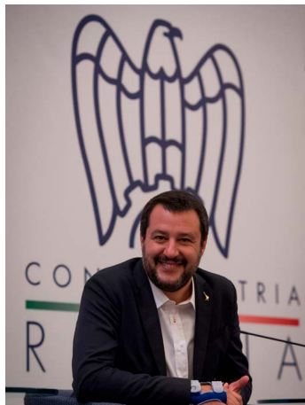
Then deputy prime minister and minister of interior Matteo Salvini at the annual meeting of Confindustria Russia on October 17, 2018, in Moscow.

The Italian and Austrian far-right, however, provided an oasis of pro-Russian sentiment. These political figures energetically condemned sanctions, supported Moscow's annexation of Crimea, and denounced the EU, NATO, and other Western institutions. Lega and the FPÖ had little power in 2014, but Moscow elevated their voices as evidence of European support. By the end of the year, Russian officials had hosted Lega members in Crimea, Putin had met with Salvini in Moscow, and Russian state-owned media were lavishing attention on sympathetic Italian and Austrian far-right figures who lamented the West's anti-Russian policies. 28 Formal cooperation agreements between Russia's ruling United Russia party and both Lega and the FPÖ soon followed. 29 If Russia could not break Europe's official position, it could at least chip away at the EU's carefully constructed image of solidarity against Moscow.