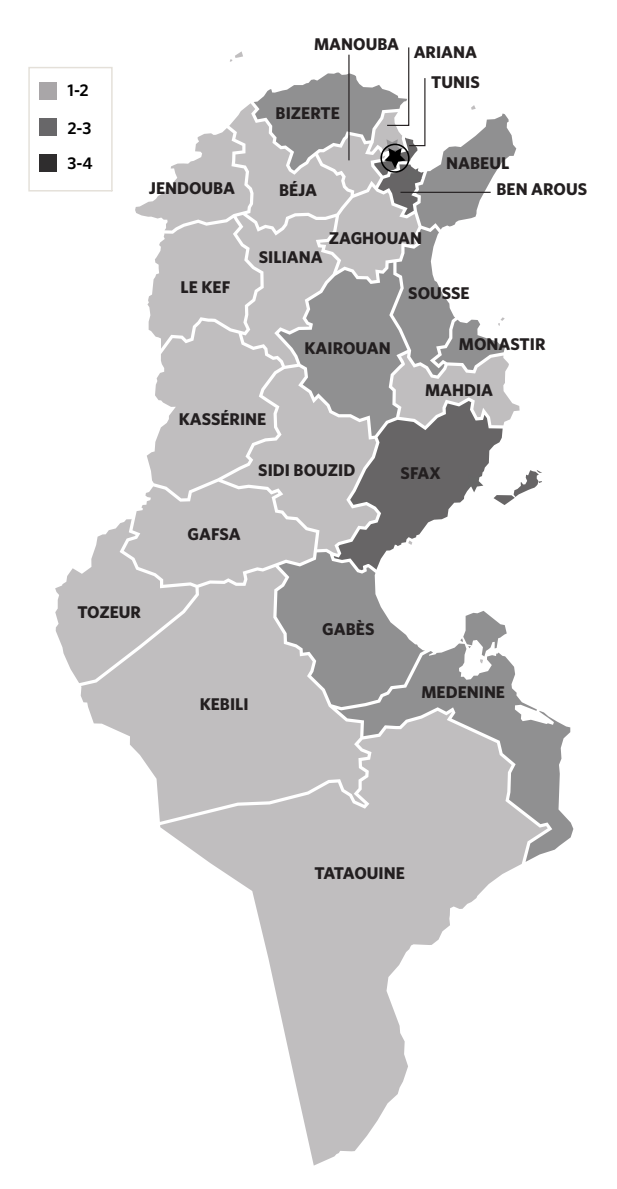
Note: The IAR is an index of 96 indicators in 6 domains (municipal services, the participatory approach, transparency and access to information, nonmunicipal services, the living environment and the availability of manpower) used to rank regions on a scale of 1-5. A higher score indicates a more attractive region.

Figure 2. Tunisia's Regional Attractiveness