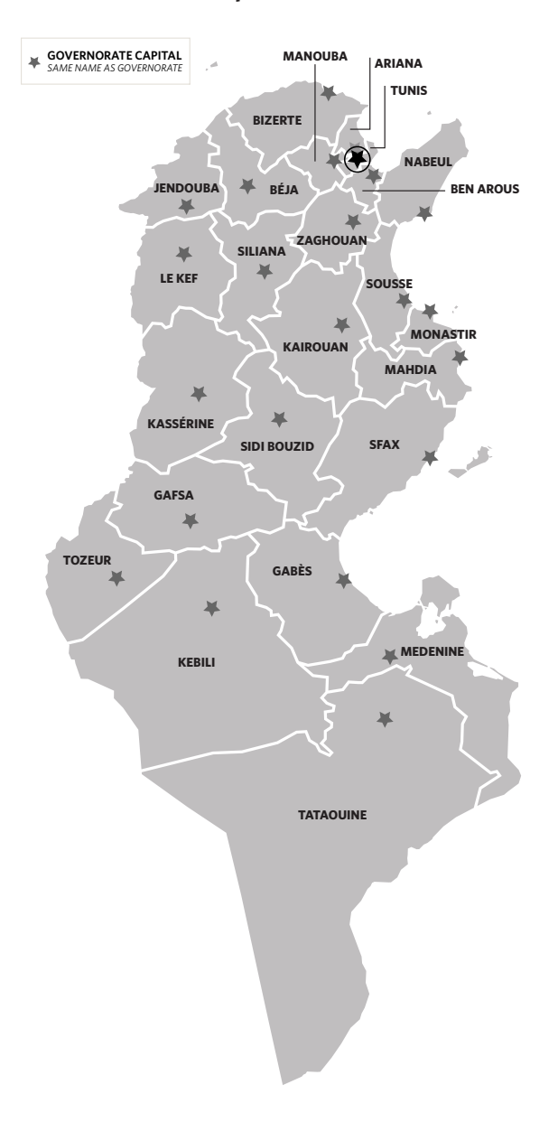
Figure 1. Tunisia Political Map

Tunisia's decentralization process has the potential to reinvigorate the democratic transition by empowering local actors, improving service delivery, injecting new energy and ideas into the policy process at the local level, and alleviating some pressure on the central government. But the process must provide long-term systemic changes to governance and fiscal authority as well as demonstrate short-term wins, particularly in the country's traditionally disadvantaged interior regions. Decentralization's success depends on it.