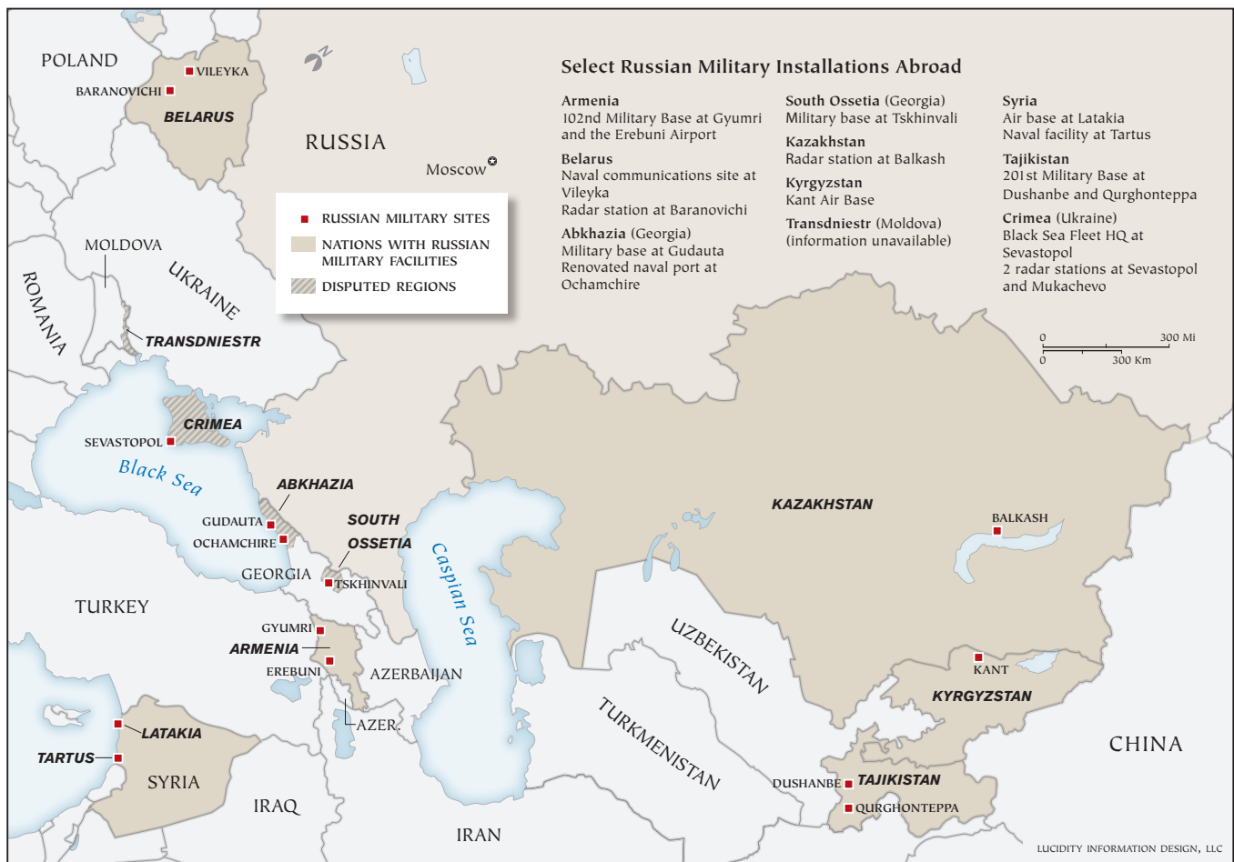
Figure 1 . Select Russian Military Installations Abroad

In Syria, Libya, and Egypt, Russia has demonstrated its rejuvenated military muscle, diplomatic agility, ability to muster considerable resources in support of its policy, and a near-total lack of scruples in pursuit of its strategic objectives. Elsewhere in the region, Moscow has mounted diplomatic offensives aimed at Iraq, Kuwait, Qatar, Saudi Arabia, and the United Arab Emirates. 50 The Kremlin has employed a variety of means, including visits by senior officials, energy diplomacy, the pursuit of trade and economic ties and investment opportunities, arms sales, and civilian nuclear energy projects to expand Russian influence and presence, signaling that Russia is returning to the Middle East as a major power and plans to stay for the long run. (Figure 1 offers a sense of Russia's expanded security presence in the Middle East, the Black Sea, and nearby former Soviet states.)