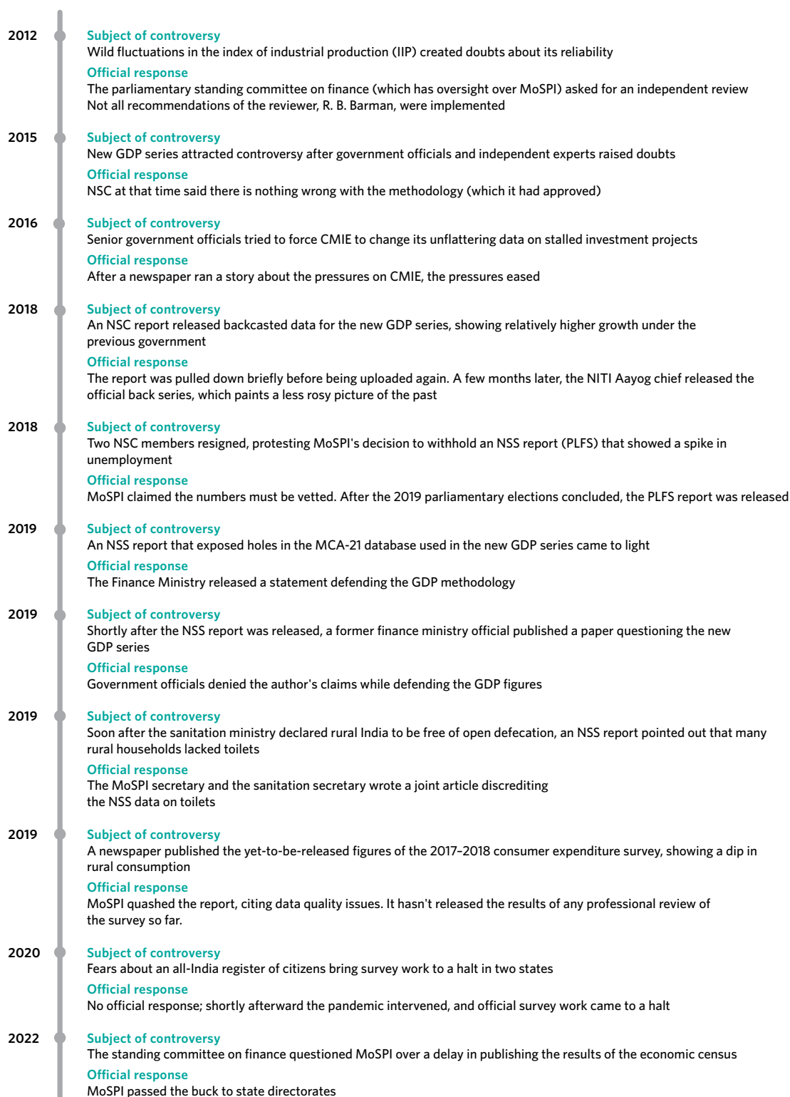
Figure 3. The Age of Statistical Controversies: A Time Line