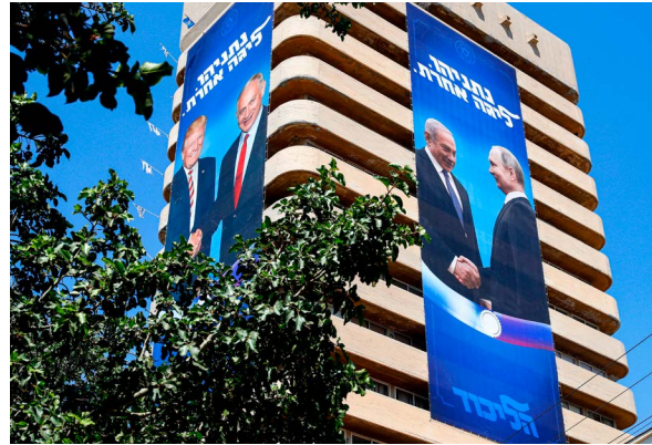
Campaign advertisements on Likud party headquarters in Tel Aviv in July 2019 showing Benjamin Netanyahu shaking hands with Vladimir Putin (right) and Donald Trump (left).

Yet in other instances, the convergence of Israeli and Russian interests was stymied by Moscow’s inability—or unwillingness—to shape events in Syria to Israel’s liking, specifically Assad’s failure to give up all of his chemical weapons and the failed attempt to push Iranian forces and Iran-backed militia groups away from sensitive regions along the Syrian-Israeli and Syrian-Jordanian borders. A local cease-fire in Daraa Governorate in southwest Syria—which was announced with flourish at Trump’s first two meetings with Putin in 2017 and collapsed before too long due to a change of heart by Moscow—illustrates this state of affairs. 25 Russian military pressure during this timeframe led to the negotiated surrender of rebel groups in the region and the formal restoration of the Assad regime’s control over the borders with Israel and Jordan. However, Moscow proved unable to deliver a deal to keep Iran’s military presence and heavy weapons away from the Syrian-Israeli border, and conveniently tried to shift blame to Washington’s handling of unrelated issues. 26