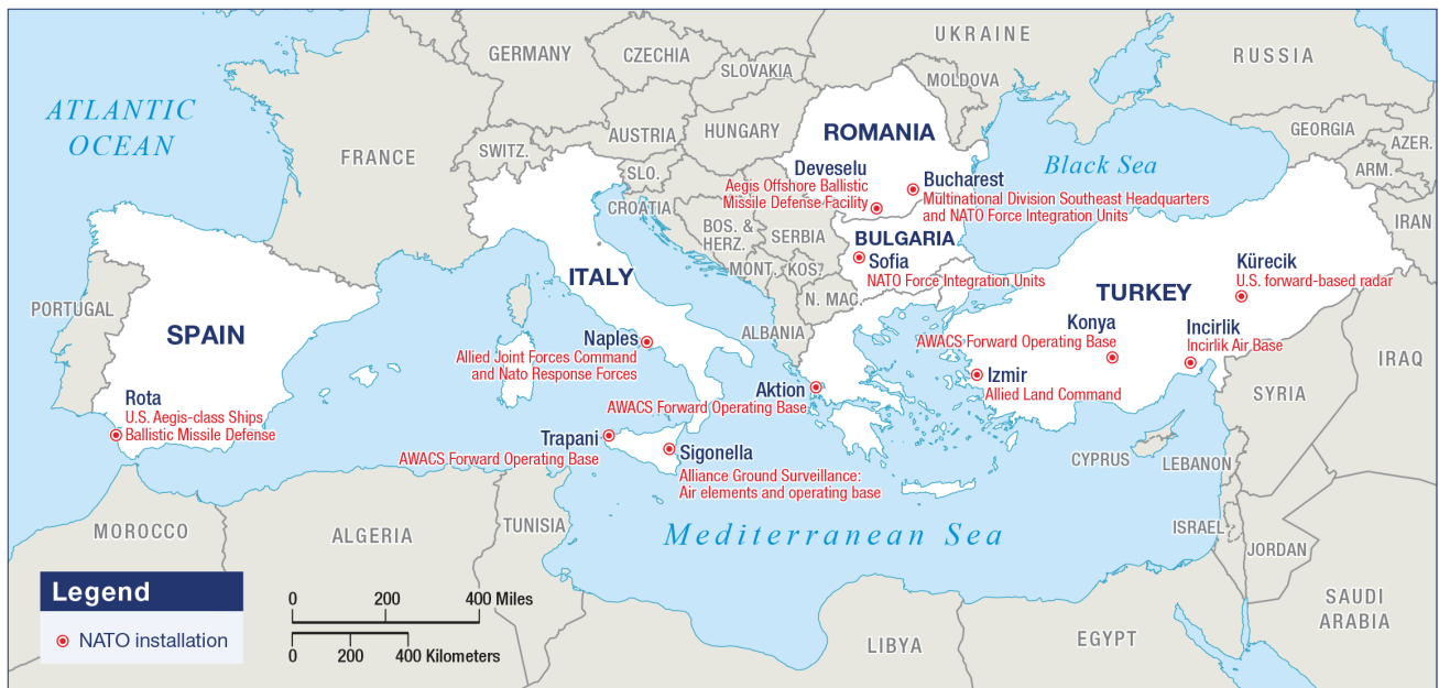
MAP 3 NATO's Presence in and Around the Mediterranean Basin